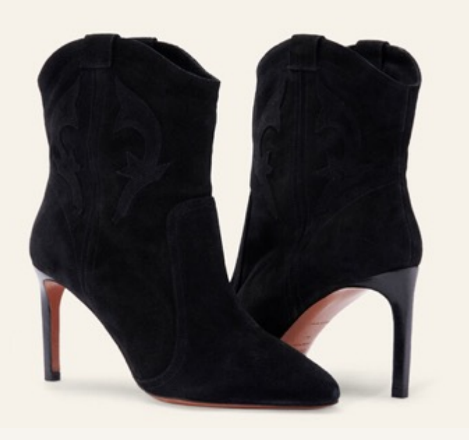
caitlin boots black.