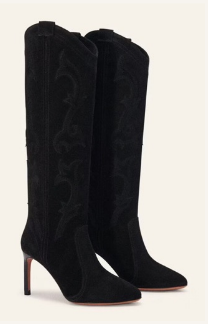
Heaitlin boots black.