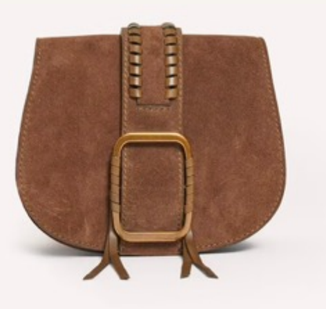
Teddy bag small kaki