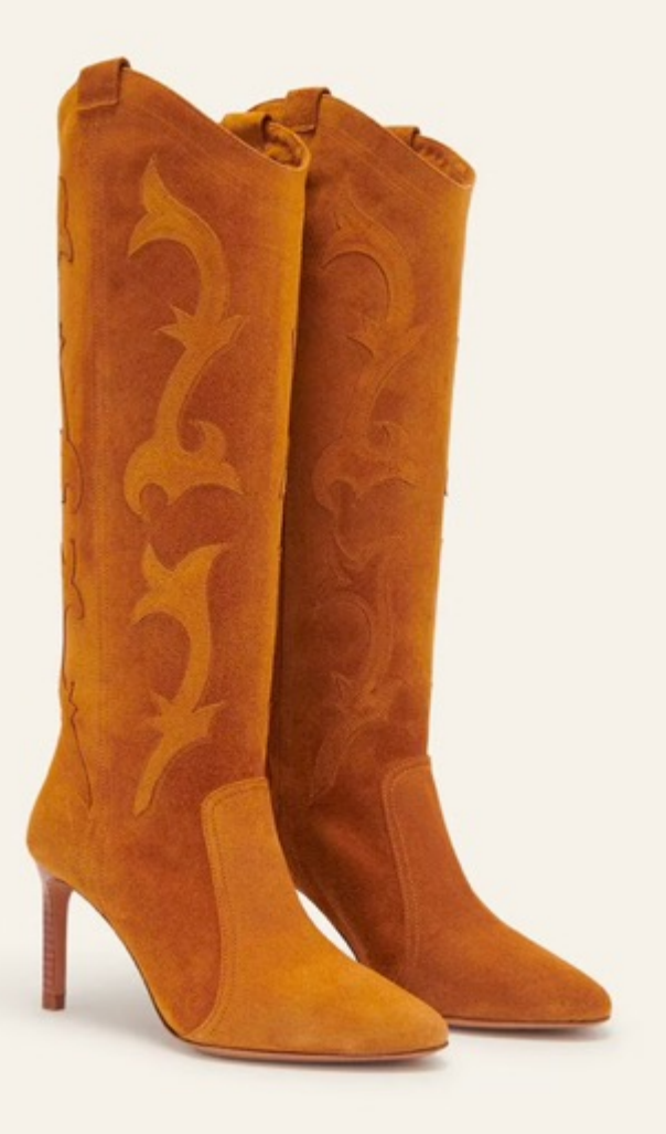
Heaitlin boots brown.