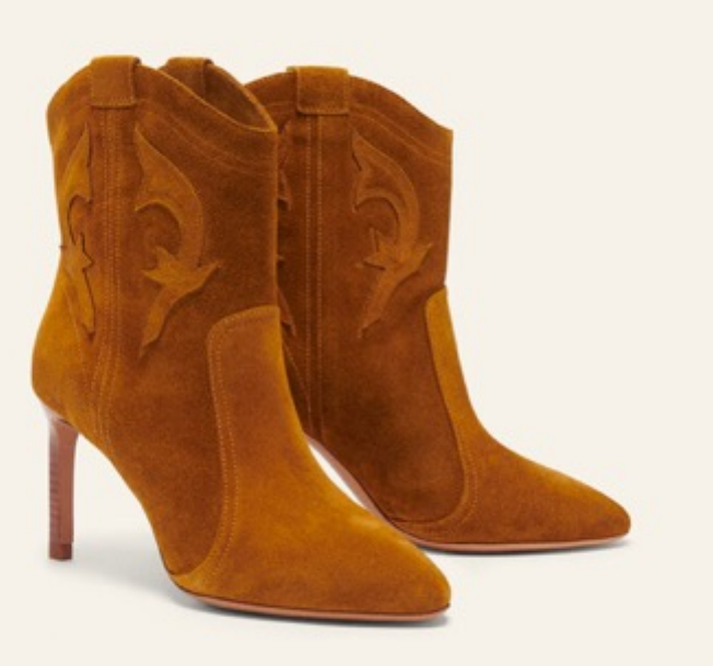
caitlin boots brown.